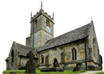
Hampton – Fairfield – Thistledown Eastwick Park – Charity Crescent