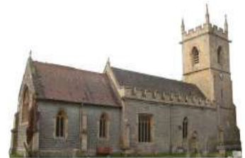
Hinton on the Green